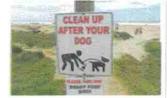
'Clean up after your dog' sign