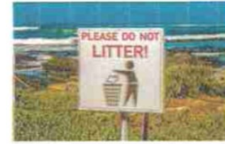
'No littering' sign