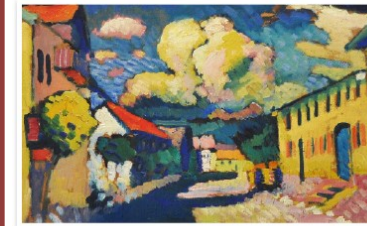
Murnau. A Village Street by Wassily Kandinsky, 1908

Expressionist artists tried to express their feelings and emotions through their paintings. This was instead of creating a realistic image of a person or object. They usually used thick paint with strong outlines and bold colours to create simple but striking pieces of art. Artists in this movement included Wassily Kandinsky and Franz Marc.