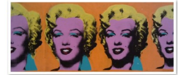
Marilyn Diptych by Andy Warhol, 1962

Pop art was a movement that used films, advertising, packaging, pop music and comics as inspiration. Bold colours, shapes and photographs were used to create images. It was a revolutionary style which completely modernised art. Some famous artists from this movement include Andy Warhol, Roy Lichtenstein and David Hockney.