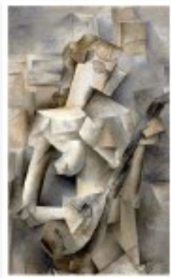
Old woman with Mandolin by Pablo Picasso, 1910

Cubism was a revolutionary style of painting that represented objects, landscapes and people as geometric shapes. Artists painted these shapes at different angles, creating images that appeared disjointed and abstract. This enabled artists to show different viewpoints at the same time. Cubism was championed by artists including Pablo Picasso, Ferdinand Léger and Robert Delaunay.